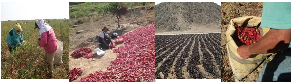
Fig. 1: Examples of dried capsicum production processing in Bolivia and Peru.