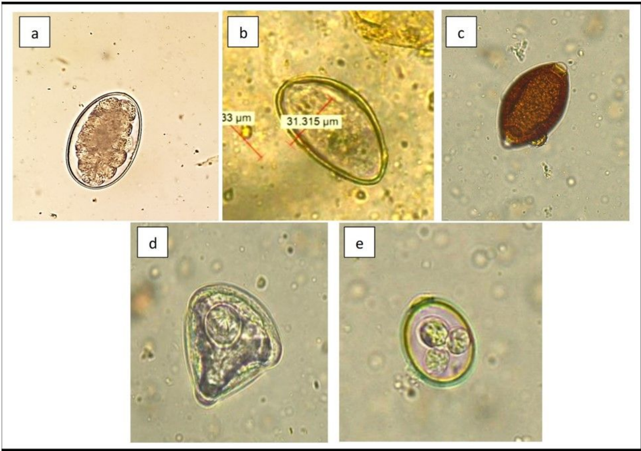
Figure 2 Gastrointestinal parasite eggs/oocysts found in goats from districts of Ayacucho, Peru. (a) Strongyle type eggs (STE), (b) Skrjabinema spp., (c) Trichuris spp., (d) Moniezia spp. and (e) Eimeria spp.